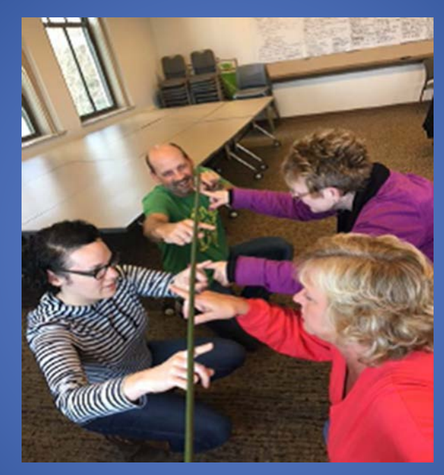
Workshop @ CCC March 18, 2016